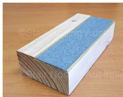
516 Sovereign gold anodised with grey carb insert 516 S/G G