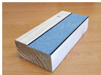
516 Black anodised grey carborundum 516-B-G