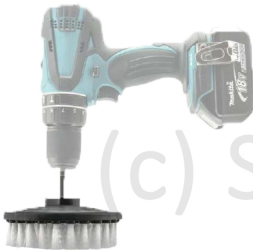
Medium duty polypropylene brush for solid FRP