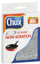
Non scratch scourer for aluminium